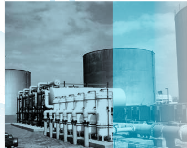
25,000 m3/day seawater RO pre-treatment system

A joint venture BOOT project company between Moya Bushnak (51%) and Kindasa Water Services (49%) supplies potable water to Saudi Airlines in Jeddah. Moya Bushnak built and operates the project with production capacity of 12,000 m 3 expandable to 25,000 m 3 under 13 years BOOT contract. The project also supplies water to trucking companies serving North Jeddah. Wessco is proud to be using state of the art RO equipment that is considered to have one of the lowest energy consumption in the whole GCC region.