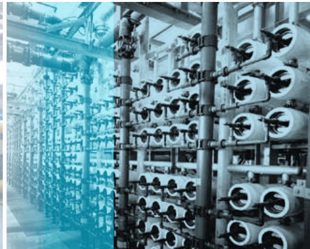
High recovery seawater RO system