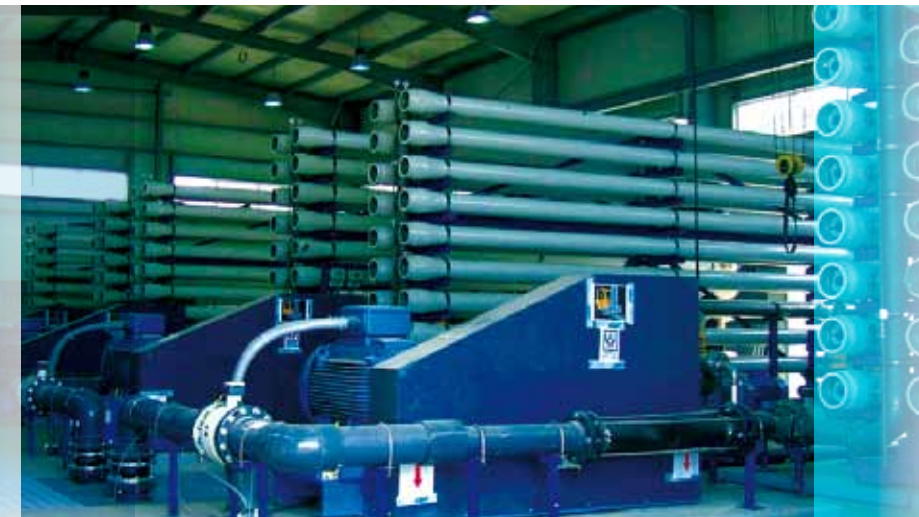
High energy efficiency seawater RO system