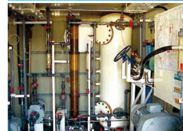
High recovery SWRO Pilot Test