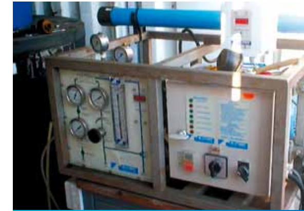
IMS Pilot Test