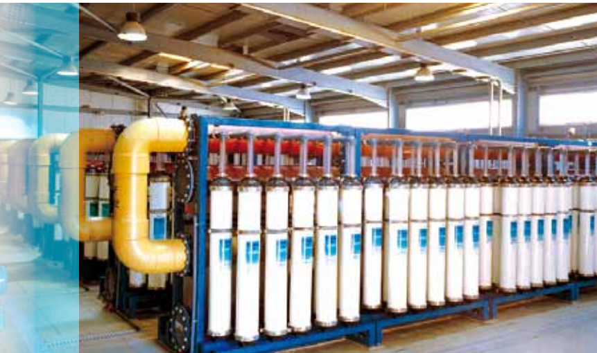
50,000 m 3 /day seawater membrane filtration system

For our complete project list please visit our website www.moyabushnak.com